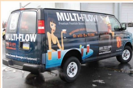
New Multi-Flow Vans!

Operational Excellence (or OPEX) is currently being rolled out to the remaining Multi-Flow areas. Be on the lookout for our new VANS!