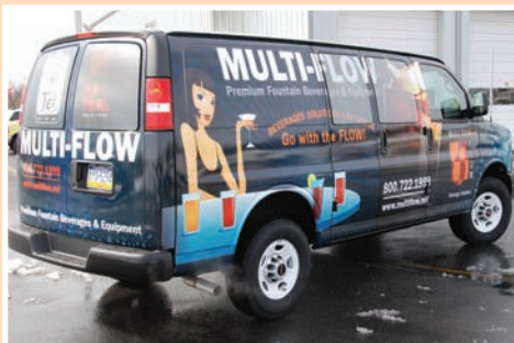
New Multi-Flow Vans!

Operational Excellence (or OPEX) is currently being rolled out to the remaining Multi-Flow areas. Be on the lookout for our new VANS!