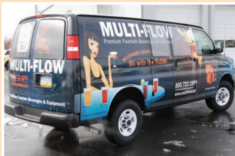
New Multi-Flow Vans!

Operational Excellence (or OPEX) is currently being rolled out to the remaining Multi-Flow areas. Be on the lookout for our new VANS!